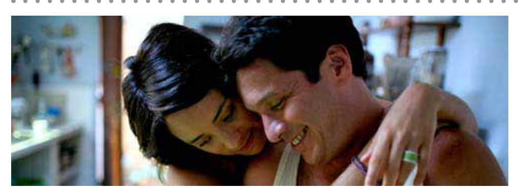
Sat./sam. March 29 mars, 19:00