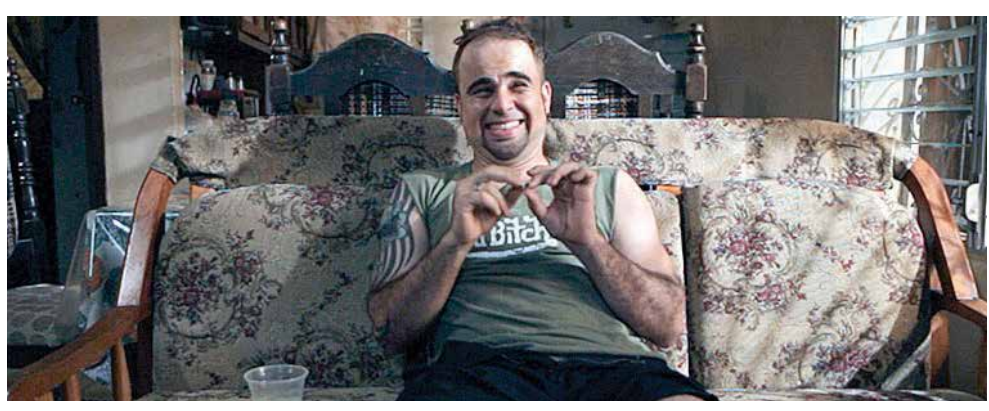
Tues./mardi April 8 avril, 19:00

Internationally acclaimed veteran Bolivian director Jorge Sanjinés ( Blood of the Condor ) chronicles the long struggle of Bolivian natives attempting to regain the sovereignty they lost at the hands of Spanish colonization and oppression in this startling film. Sanjinés reconstructs in astonishingly daring dramatic sequences a variety of historical events where indigenous heroes achieved extraordinary feats, culminating with the ascension of a native to Bolivia's presidency. An engaging combination of fiction, fact, and historical reckoning. English sub-titles.