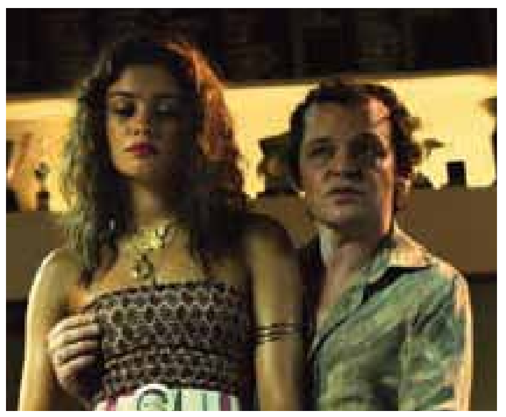
Thurs./jeudi March 27 mars, 19:00

Our inaugural ¡Fiesta Latina! takes place on Saturday, 29 March, from 1:00PM to 7:00PM and will feature samples and performances of Latin American music, food, wine, dance, coffee, literature, sport, and visual arts. Come and join us! Admission is free! Please see the middle portion of this brochure for all the exciting details.